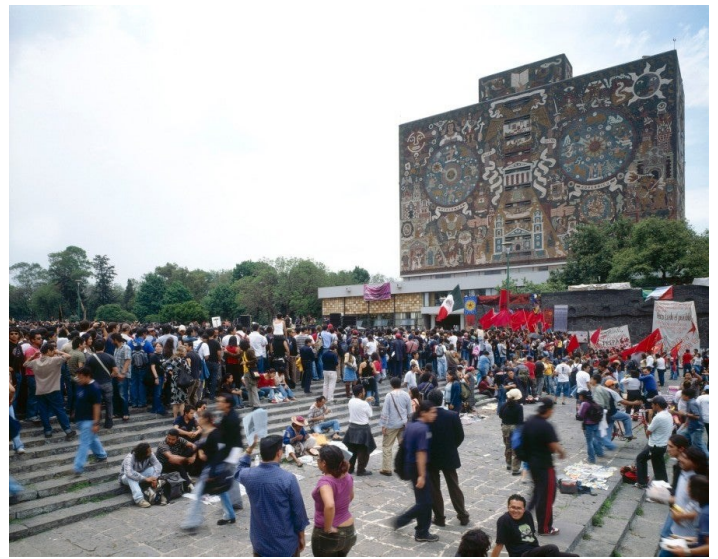
Mardi 2 mai 2006. Mexico. Rassemblement et discours du Délégué Zéro à l'Universidad Nacional Autónoma de México, Forum de la Cité Universitaire. From the 'La Otra' series, 2006.