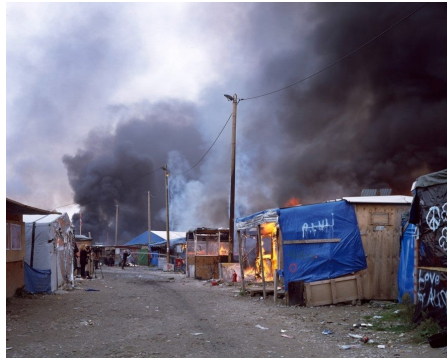
Bruno Serralongue, Un incendie ravage le "bidonville d'Etat" pour migrants au moment de son démantèlement, Calais, 26 octobre 2016. From the 'Calais' series, 2006-20. © Air de Paris, Romainville