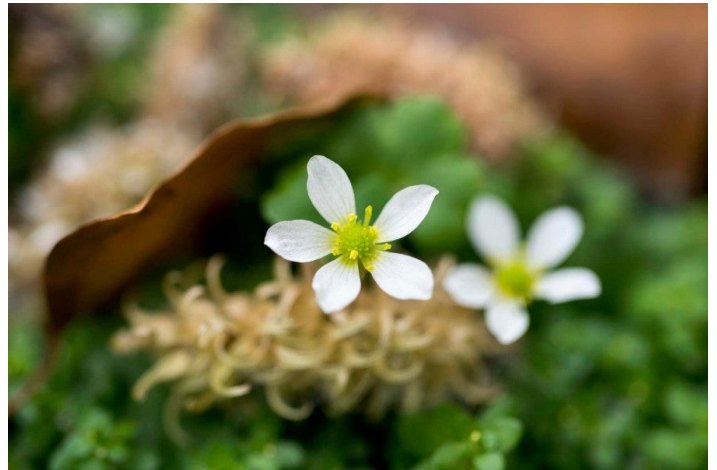
Bruno Serralongue, Ranunculus omiophyllus (renoncule de Lenormand) et flou en arrière plan un Chaton de saule. Photographie prise pendant la sortie des Naturalistes en lutte sur la ZAD de Notre-Dame-des-Landes le dimanche 8 mai 2016. From the 'Notre-Dame-des-Landes' series, 2014-18. © Air de Paris, Romainville