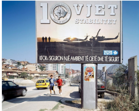
Bruno Serralongue, "10 ans de stabilité", Pristina, septembre 2009. From the 'Kosovo (ensemble 1)' series, 2009.