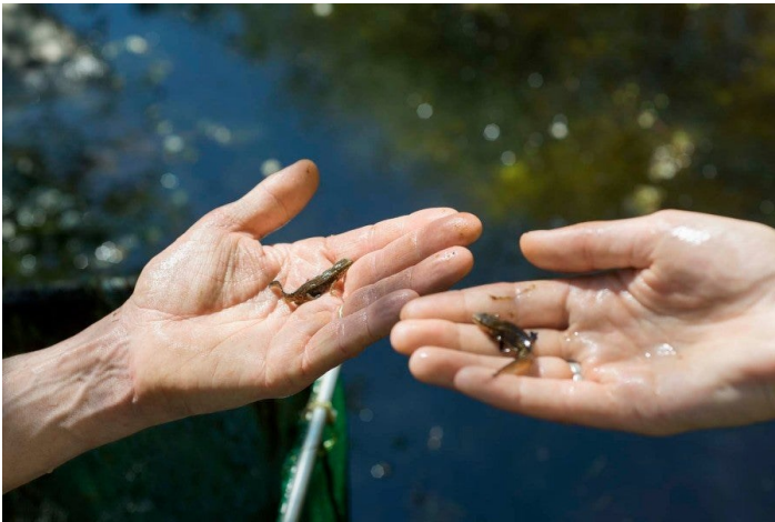
Bruno Serralongue, Comptage des Tritons Crêtés. Photographie prise pendant la sortie des Naturalistes en lutte sur la ZAD de Notre-Dame-des-Landes le dimanche 9 avril 2017. From the 'Notre-Dame-des-Landes' series, 2014-18.

'Comptes-rendus photographiques des sorties des Naturalistes en lutte sur la ZAD de Notre-Dame-des-Landes', 2015-17. A comment by Jay Jordan, an artist, author and activist, and co-founder of The Laboratory of Insurrectionary Imagination and an inhabitant of ZAD, France.