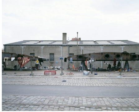
Bruno Serralongue, Abri # 1, Calais, juillet 2006. From the 'Calais' series, 2006-20. © Air de Paris, Romainville