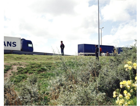
Bruno Serralongue, Passer en Angleterre, Accès terminal transmanche, Calais, juillet 2007. From the 'Calais' series, 2006-20.

Three predominant threads emerge when I look at Serralongue's main line of work: portraying First Nations and Indigenous people in their militant campaigns, following various ecological and social movements, and finally, accompanying migrants on their routes such as the sans-papiers in Paris or the Jungle in Calais. All those 'currents' employ the method of an anti-reportage, in which a photographer, rather than accumulating the best snaps of the event, shares the feeling of being and growing with the movement, as well as reveals the structure and the invisible labour that constructed and enabled it . 9 I am sticking again to his exception, the 'Sunday afternoon' series, presumably innocent and banal pictures from a park in Rio de Janeiro, and I wonder: how are those photos liberated from the spectacular? Is there a respectful relationship? Can a relationship be asymmetrical and ethical at the same time? And what parameters need to be in place for a photographer to be able to borrow from others' stories? I also see calmness.