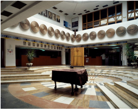
Bruno Serralongue, Bibliothèque nationale du Kosovo, Pristina, septembre 2009. From the 'Kosovo (ensemble 1)' series, 2009.