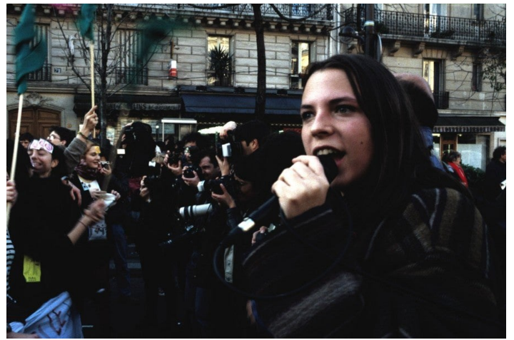
Bruno Serralongue, 'Les Manifestations (décembre 1995 - janvier 1996)', 1995-96. Series of 680 colour slides.