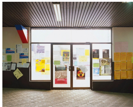
Bruno Serralongue, Posters, Civil Society Forum, NASREC, Johannesburg, 29.08.02. From the 'Earth Summit' series, 2002.