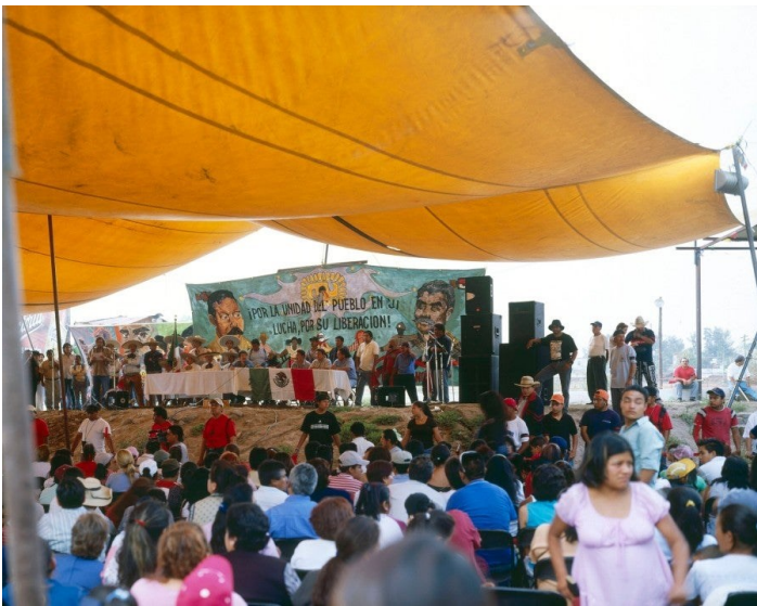
Bruno Serralongue, Vendredi 28 avril 2006. Région Est de Mexico (Iztapalapa, Iztacalco et Tlahuac). Bienvenue au Délégué Zéro. Lienzo Charro Los Reyes FPFVI-UNOPII, Iztapalapa. From the 'La Otra' series, 2006.

Photography as a genre is deeply embedded in that model of ubiquitous conquering, possessing, depriving. Historically, photography has been both a tool for activism, documenting struggles, visions, politics and the unconscious but, even more so, it has been responsible for serving extraction, colonization and various forms of oppression, consequences of which still linger today. Photography thus can be a violent act, a separation between subjects and photographer, and an imposition of a patronising gaze and representation. At the same time, it can be seen as a mediator, as a potential carrier of resilience and reconciliation, a proof of violence, a token in regaining dignity. Serralongue is a contemporary artist who works to investigate how the language of art, and in his case anti-reportage photography, can become a way of unlearning the existing forms and norms of cultural domination and imperialism. Although he too, as everyone, is implicated.