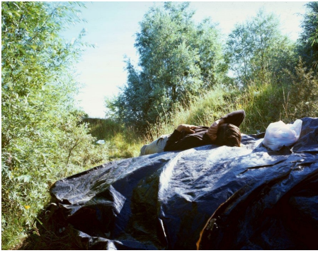
Bruno Serralongue, L'endormi (Abel), terrain vague à proximité de l'hôpital, Calais, 21 juillet 2020. From the 'Calais' series, 2006-20.