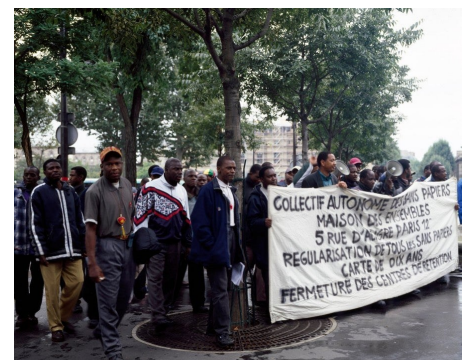
Bruno Serralongue, 'Manifestation du collectif des sans-papiers de la Maison des Ensembles, place du Châtelet, Paris, samedi 08 septembre 2001 à samedi 11 janvier 2003', 2001-03. Series of 45 colour photographs.

In contrast, Serralongue’s works can seem unspectacular and random – be it