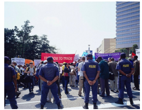
Bruno Serralongue, Street Hawkers and Farmers from Africa and Asia March to demand the Freedom to Trade, Speaker's Corner, Sandton, Johannesburg, 28.08.02. From the 'Earth Summit' series, 2002. © Air de Paris, Romainville