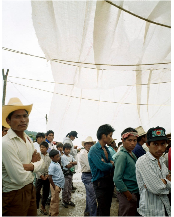
Bruno Serralongue, Indiens (Chiapas), 1996. From the 'Encuentro' series, 1996.

For many years, he worked against the hegemonic language of photo reporting, the structural racism perpetuated in seemingly objective Western newspaper news, often photographing the scene of an event a day after, and keeping a position of, what he calls, “solidarity with a distance .” 4 He has long worked against the presupposition that physical proximity brings one closer to the given context. He rather chooses to exhaust and expand the gaze in his purposely ‘not very eventful’ point of view. The camera he uses is a classical camera obscura, a photographic chamber. The photos can not be reworked and they take time to be made. For example in the 15 years of his presence in The Calais Jungle, Serralongue took only 89 pictures. His work is almost like the far opposite of Instagram stories: there are very few of them and they do not disappear. “My photos are not meant for the internet, I don’t have a website. They are meant for gallery walls, and they come back on display every couple of years.”