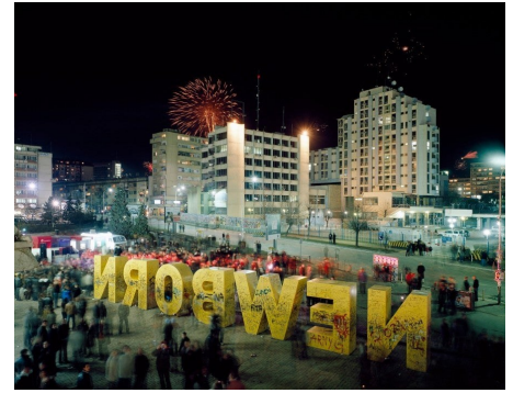
Bruno Serralongue, Newborn, Pristina, Kosovo, mardi 17 février 2009. From the 'Kosovo (ensemble 1)' series, 2009.

On 28 October 2021, at 10:07:37, Flaka Haliti wrote: