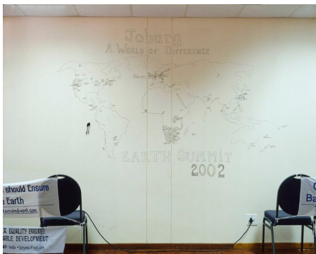
Bruno Serralongue, A World of Difference, Peoples Earth Summit, Saint Stithians College, Johannesburg, 30.08.02. From the 'Earth Summit' series, 2002. © Air de Paris, Romainville