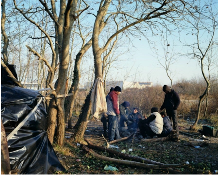
Bruno Serralongue, Groupe d'hommes 2, Calais, décembre 2008. From the 'Calais' series, 2006-20.