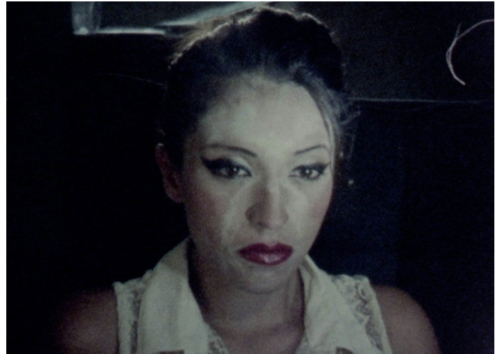
Jean-Charles Hue, Crystal Bullet , 2015, 7 min.