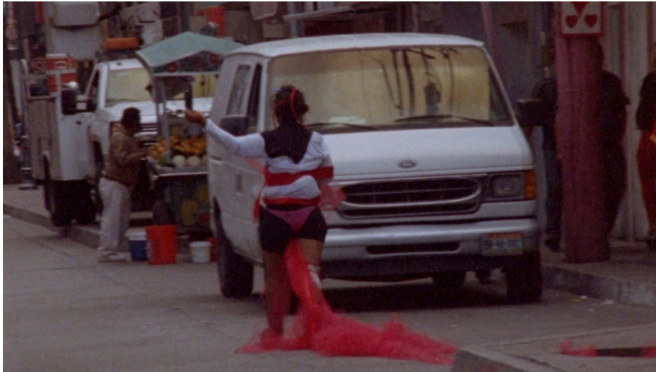
Jean-Charles Hue, Tijuana Tales , 2017, 12 min. Courtesy of the artist and Michel Rein, Paris/Brussels.