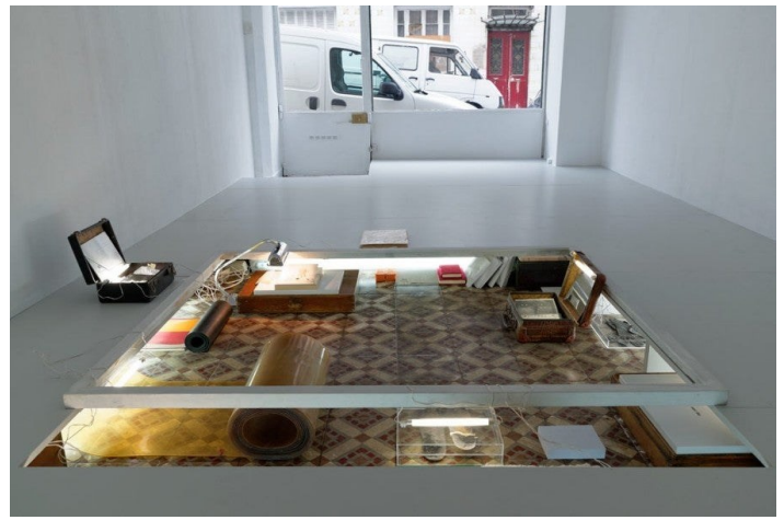
Laura Lamiel, L'espace du dedans, 2014. Exhibition view 'Sequence I II', Marcelle Alix, Paris, 2014.