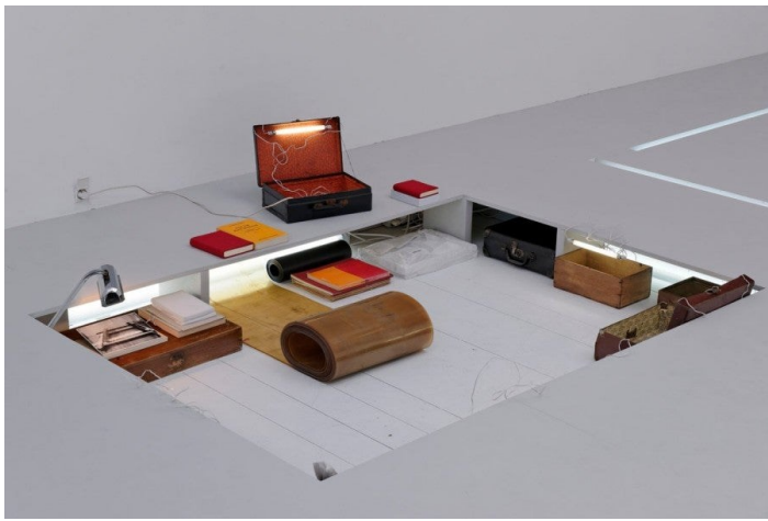
Laura Lamiel, L'espace du dedans (detail), 2014, wood, leather suitcases, enamelled steel, various elements, variable dimensions, unique work. Exhibition view of 'la vie domestique', Parc Saint Léger, centre d'art contemporain de Pougues les Eaux.