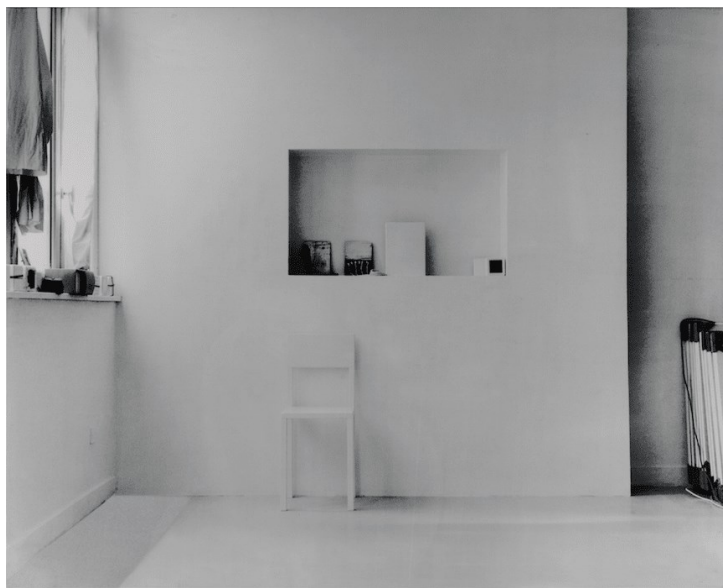
Laura Lamiel, untitled, 2003. (Showing a studio view from the series Avoir lieu .)

up to semantic sense, letters that combined to form words, let alone written symbols of any kind. A significant exception may prove the rule: Though three recent tabletop sculptures include pieces of printer paper scrawled with red ink, pages that she'd used as scratch paper, her handwriting is illegibly small, morphing instead into pointillist clouds. (The works, titled Forclose (2017), present stacks of white clothes, boxes, and papers, and under the table, dyed-red strings draw lines hanging down to a mirror underneath; the underside of the glass tabletop is foregrounded, visually, to the same extent as the top surface.) But through into the early 2000s, Lamiel's works were often if not mostly untitled, and she has almost never published any of her own writing . 10 When I asked Lamiel's most regular, longest-running conversation partner, art historian Jacques Leenhardt, whether Lamiel's work isn't somehow pre-lingual, he replied, "I'd even say it's without language." (This may have changed, as her titles have recently become rather poetic.) All the while, a frequent motif in writing about Lamiel's work has concerned her 'vocabulary', her 'personal language', her 'sculptural language' – perhaps because, in the absence of verbal or written language, Lamiel has long presented a material language, or a formal one.