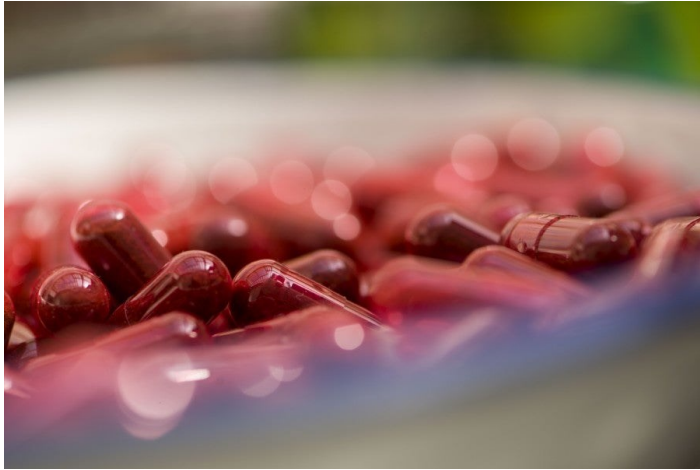
Benoît Piéron, The Great Piece of Turf after Dürer - workshop , 2021. Collective seed bomb workshop inspired by the seeds in Dürer's watercolors.

Ancenis (2021) where he also gave a workshop on Jarman's garden after which the participants received capsules filled with seeds from the plants found at Prospect Cottage . 16 Although still premature during my visit, the last iteration has been flourishing in the garden in Lens. One does not normally get to see a plant growing and changing, one sees it has grown and changed. Through this slowness, on the one hand, the existence of alternative temporalities becomes visible. Yet, on the other, the work reveals processes of both cultivation and natural transformation that exemplify the notion of transcorporeality and the reciprocal relationship between natural and human-made existences.