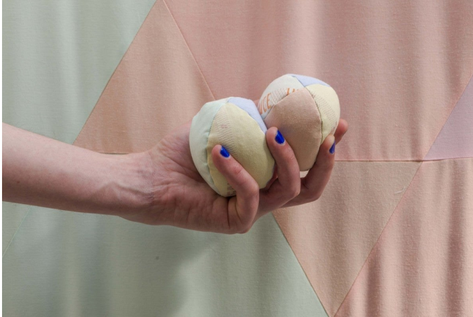
Benoît Piéron, Patchworkshop , 2022, workshop combining a conversation with art historian Géraldine Gourbe and the making of juggling balls from hospital sheets filled with millet seeds.