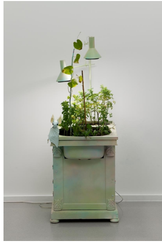
Benoît Piéron, L'Écritoire (Writing Table) , 2023, painted furniture, glitter, plush, deadly plants, horticultural light, sewing pattern by BeeZee art.