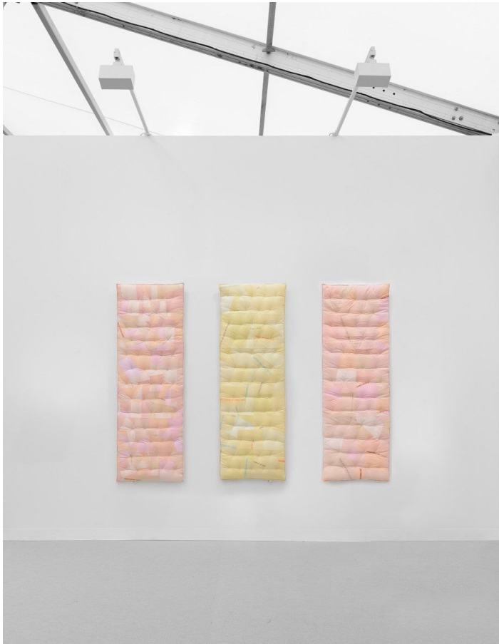
Benoît Piéron, Matelas de plage (Beach Mattress), 2022. Foam and padding.

Traces of the past are present throughout Piéron's works with fabric. The aforementioned pastel-coloured fabric used to make the stuffed bats is upcycled hospital fabric including bed sheets. After being thoroughly cleaned, the fabric is resold at the large French DIY chain store Leroy Merlin. Nevertheless, traces of bodily fluids may remain visible on the pieces of fabric. Piéron has used this material to create several works that often pay tribute to the ill and hospitalised, like in maybepole or Matelas de plage series (2022), the latter consisting of four patchwork mattresses hung from the wall as a soft monument for the bedridden. Besides being the default colours of such hospital sheets, the pastel shades also have less heroic connotations for Piéron, because of their in-between position in colour schemes. 11 Taking all this into consideration, the artist's use of this material as a base for multiple works gives the previous users an immediate yet spectral presence within the exhibition spaces. He commemorates and celebrates those who have found themselves in peripheral hospital settings, which exist in continuous parallel to the public sphere.