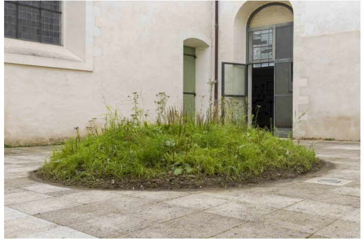
Benoît Piéron, The Great Piece of Turf after Dürer , since 2021. Achillea millefolium - Agrostis stolonifera - Arrhenatherum eliatius - Bellis perennis - Cardamine pratensis - Cynoglossum officinale - Plantago major - Taraxacum officinale . Photo: Benoît Piéron