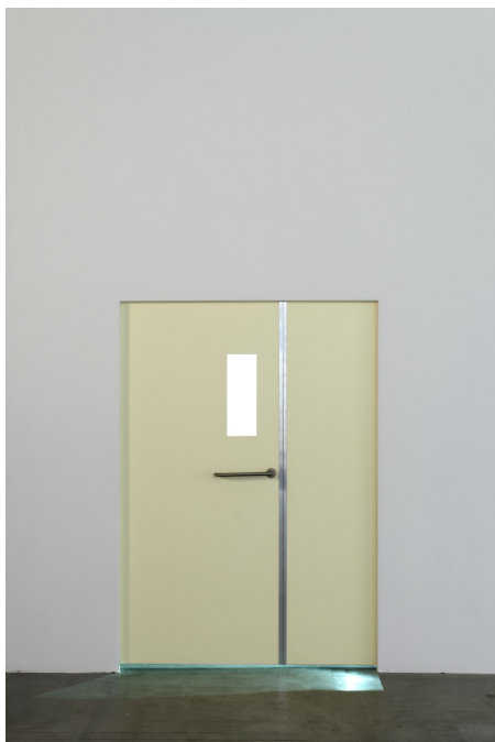
Benoît Piéron, Le Rayon (The Ray), 2023, Video installation consisting of a reconstructed hospital door with an overhead projection system.