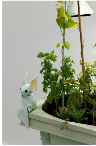
Benoît Piéron, L'Écritoire (Writing Table) , 2023, painted furniture, glitter, plush, deadly plants, horticultural light, sewing pattern by BeeZee art.