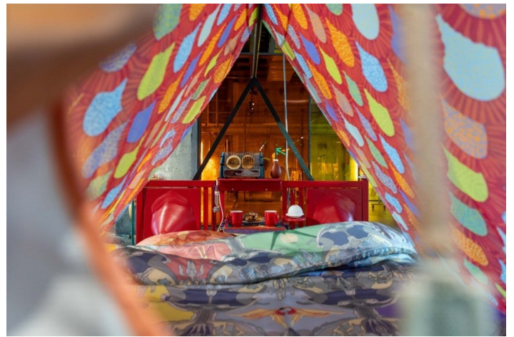
Benoît Piéron, Le Lit (The Bed) , 2011.