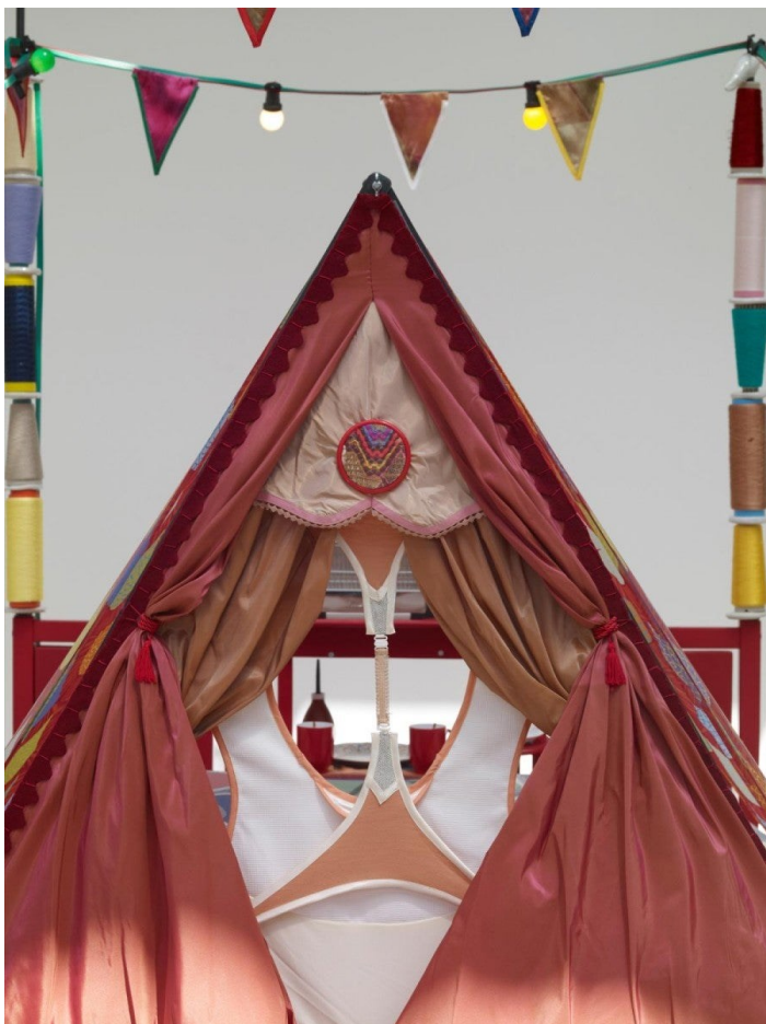
Benoît Piéron, Le Lit (The Bed) , 2011.