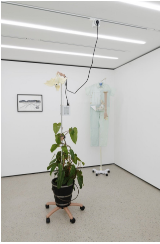
Benoît Piéron, Monstera , 2022. Serum holder, plaster, bucket, plant tar, Monstera, horticultural lamp, psychopump plush made from patchwork of hospital sheets.