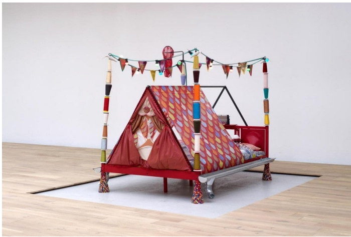
Benoît Piéron, Le Lit (The Bed) , 2011, wood, thumbtack, metal, glazed stoneware, print on silk twill and waterproof silk chiffon, taffeta, garland and toaster. Photo: Marc Damage. Courtesy Benoît Piéron and Fondation d'entreprise Hermès