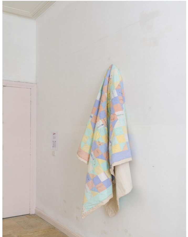
Benoît Piéron, Le plaid , 2021. Quilting and patchwork from hospital sheets.