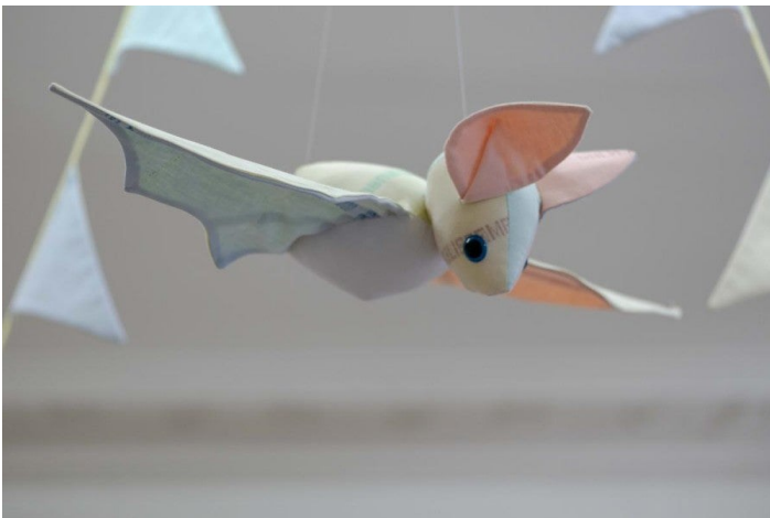
Benoît Piéron, Maybepole (detail), 2022, plush bat made from used hospital sheets, sewing pattern by BeeZee art.