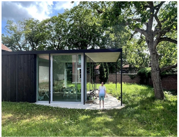
Benoît Piéron's studio in Lens, 2023.

By shifting focus and decelerating pace, Piéron interrupts the flow of everyday routines and critiques our fast-paced neoliberal capitalist society and its ignorance of people not always able to keep up with its stride, due to unstable physical conditions ranging from the short term to the chronic. Something like that will happen to many of us, somehow, somewhere along the line. Fortunately, as Piéron represents and makes palpable, we can find companionship in plants, bats, and vampires, as well as in the spirits of other people who found themselves in a similar situation in the past, those who are still in such a situation and those who always will be.