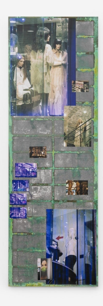
Mimosa Echard, Angoisse mythique (La théorie de l'évolution) , 2024, canvas streched on aluminium frame, oxidised anti-radiation fabric, oxidised lambda c-prints on glossy RC paper, transparent acrylic varnish, embroidered tulle, 235 x 78 x 3 cm. Photo: Jiayun Deng. Courtesy of Galerie Chantal Crousel and the artist © Mimosa Echard/ADAGP, Paris, 2025

What records of information do Echard's works offer? Chromatic, contaminated, communicative, full of biological resonance and synthetic matter, material histories and paranoia, eros and its slippery longing for capture, forms transforming and traveling, on loop. Like letters, communicating distances, longing and its languages, change or stasis. Surface flows as sacred springs as epistolary flows, as narrative and its technology both. From the flow of water to the flow of images, from the poor image to the rusting, oxidized surface, the synthetic pills to the healing plants, the libidinal to the sterilized, the charm to the antenna, the binary to the nonbinary, the protected or unprotected childhood to its most consumerist vision, material cultures to the prismatic orders of the immaterial.