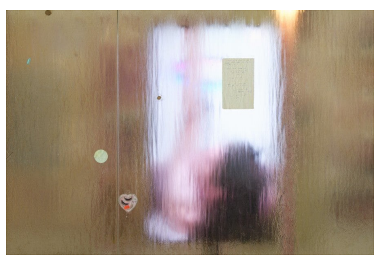
Escape More, 2022, exhibition view, Prix Marcel Duchamp, Centre Pompidou, Paris, France, 2022.

More, it invokes both sacred springs and their recent corporate cousins, the minimalist water walls of business towers and shopping malls. Myriad forms of montage were given, from the flow of water to the flow of moving images to the flow of surface to the flow of one's eyes across it all. Her water colored a faint yellow, like the mare urine used in hormone-replacement therapy; her images—advertorial, medical, gendered—overflowed with water, offering some neo-Impressionist-tinged fluid image. Water not meant to be felt but to be looked at, healing turned into an optical experience.