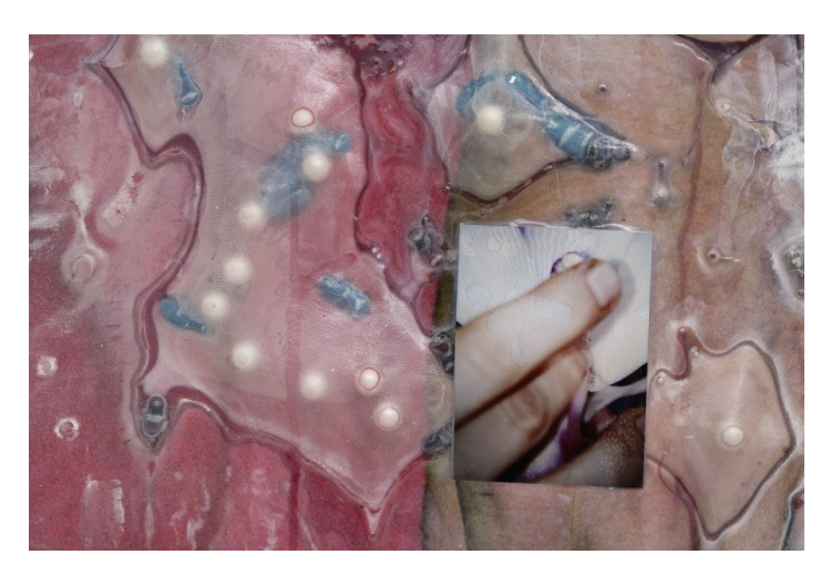
Mimosa Echard, Your hand, 2022, c-print, printed fabric, plastic beads, capsules, seed beads, clitoria flowers, metal bracelet, poppy seed, acrylic paint, acrylic glue and acrylic lacquer, 125 x 90 x 3 cm.