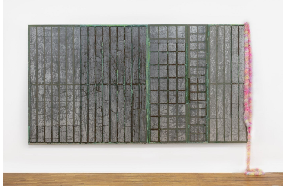
Mimosa Echard, Passage , 2024, canvas streched on aluminium frame, oxidised anti-radiation fabric, oxidized aluminum foil, transparent acrylic varnish, feather boa, 235 \times 430 \times 3 cm. Photo: Martin Argyroglo. Courtesy of the artist and galerie Chantal Crousel, © Mimosa Echard/ADAGP, Paris, 2025