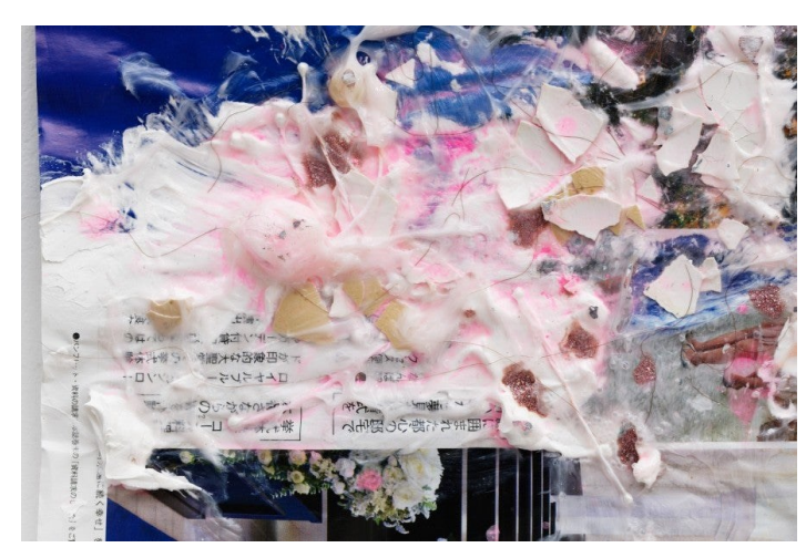
Mimosa Echard, Powder Room , 2019, magazine page, acrylic paint, cosmetics, fake flower pistils, hair, eggshell fragments, Job's tears seeds, Narcissus bulb bark, moxas, 45,3 x 30,2 x 1 cm. Photos: Aurélien Mole. Courtesy of the artist and Galerie Chantal Crousel, Paris © Mimosa Echard/ADAGP, Paris, 2025