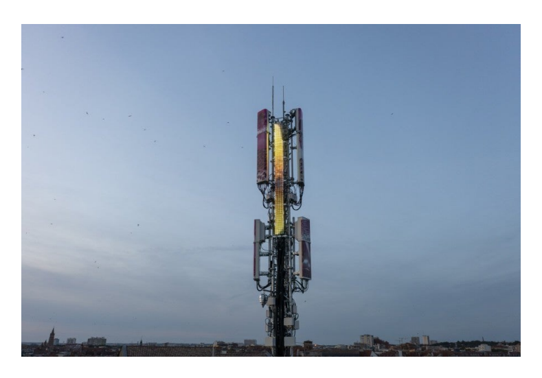
Mimosa Echard, Lady's glove , 2024, site specific installation, installation view, Nouveau Printemps, Parking des Carmes, Toulouse, France, 2024. Photo: Lydie Lecarpentier. Courtesy of the artist © Mimosa Echard/ADAGP, Paris, 2025

I looked again at the gold and silver foils Echard used for her paintings, offering protection from electromagnetic rays, then at the arcade photographs of mannequins baked into their surfaces. The slim, attenuated figures might be characters in Hotel des Mimosas, at once alienated and artificial, between objects and actors, each giving anachronistic glamour, signaling pathos and bathos both. They are beacons of some localized signal, all material language and deafening static. Karen Barad once wrote of the machinations of power, its material constraints: "The body reacts to the forces, manifest as shifting material alignments and changes in potential, and becomes not simply the receiver but also the transmitter or local source of the signal or sign that operates through it." "11"